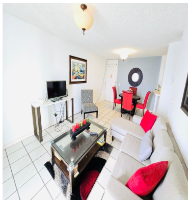
SEE THIS PROPERTY IN MAP