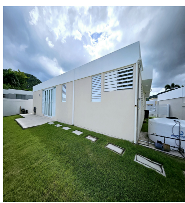
SEE THIS PROPERTY IN MAP