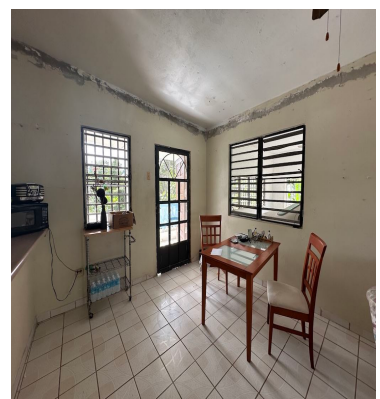
SEE THIS PROPERTY IN MAP