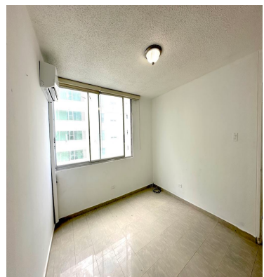
SEE THIS PROPERTY IN MAP