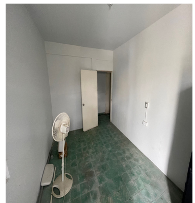
SEE THIS PROPERTY IN MAP