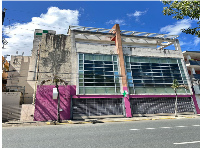
LUIS MUÑOZ RIVERA AVENUE SCENE