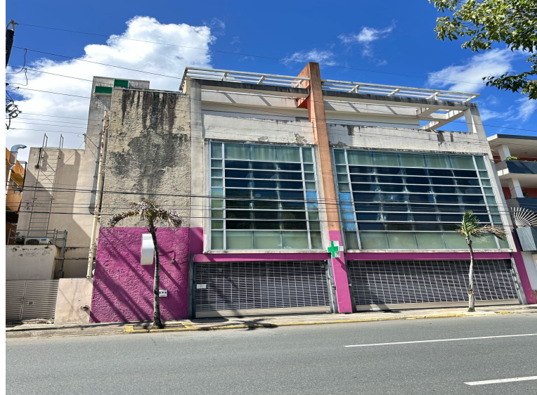
LUIS MUÑOZ RIVERA AVENUE SCENE