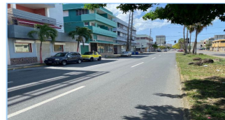
LAS MARIAS AVENUE SCENE