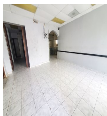
SEE THIS PROPERTY IN MAP